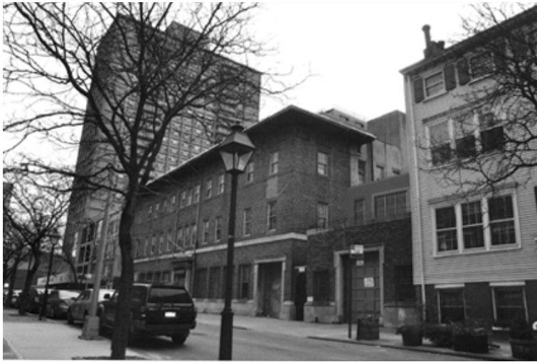
A view of 72 Poplar St., the former police precinct building (with attached garage), in Brooklyn Heights.

As the Eagle reported, Community Board 2 gave its unanimous approval to the latest design last month with two recommended modifications: moving the proposed one-story addition on the adjacent garage forward to be more aligned with the street; and simplifying the design of the new rear window openings by removing the arch, but maintaining the same window size.